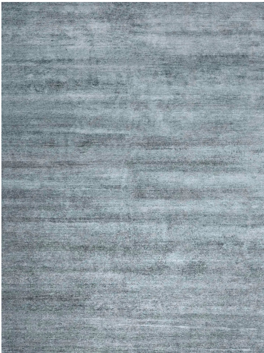
Product ID# 54934